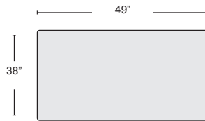
STORAGE COCKTAIL OTTOMAN #258357 $150.00 QTY_