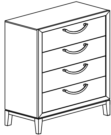
COMPLETED CHEST ASSEMBLY