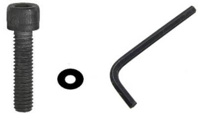
Allen Cap Bolt x 12 ; Washer x 12; Allen Key x 1