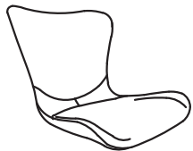
A (1 pc)