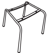
B (1 pc)