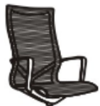
A (1 pc)