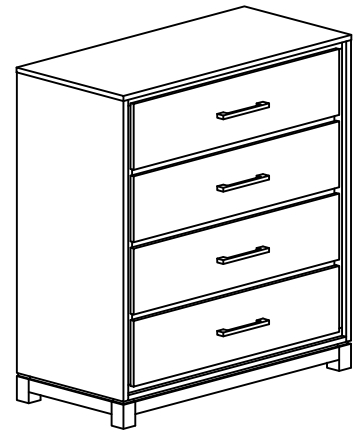
COMPLETED CHEST ASSEMBLY